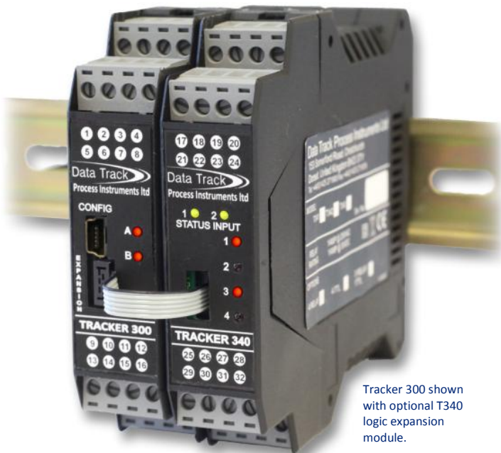
Tracker 300 shown with optional T340 logic expansion module.

For Signal Conditioning, Data Acquisition, PID Control and Alarms