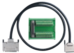
Termination Board DIN-68S Mating Cable ACL-10568-1

Termination Board with a 68-pin SCSI-II Connector and DIN-Rail Mounting (Cables are not included). For information on mating cables, refer to Section 9.)