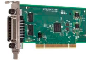
82350C with low-profile bracket