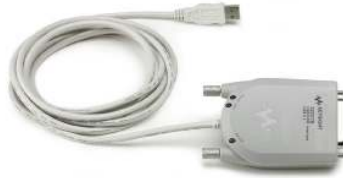
Boosting performance with simplest connectivity

The 82357B USB/GPIB interface implements USB 1.1 (12 Mbits/s) and is compatible with USB 2.0. The 82357B USB/GPIB interface uses a thin, flexible, high-quality USB cable that is USB 2.0-compliant. The USB cable is shielded, and the connector is specified to 1,500 insertions, ensuring a durable connection and reliable data transfer.