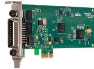
82351B with low-profile bracket