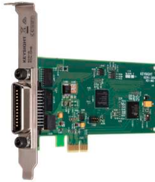
82351B with standard profile bracket

PCIe is the next generation of PCI and offers unsurpassed speed and performance, making PCIe cards an ideal choice for many computer platforms and automation applications. It is full backward compatible with PCI-configured software or coding, removing the need to reconfigure any code. The 82351B is highly flexible with plug-and-play configuration and enables usage in a low-profile PC with a bracket change.