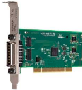
82350C with standard profile bracket

The 82350C interface card is fully compatible with IEEE-488 control and communication standard, de-couples GPIB transfers from PCI bus transfers. Buffering provides I/O and system performance that is superior to direct memory access (DMA). The hardware is software configurable and compatible with the plug-and-play standard for easy installation. The GPIB interface card offers high flexibility to plug into standard or low profile PC with a bracket change.