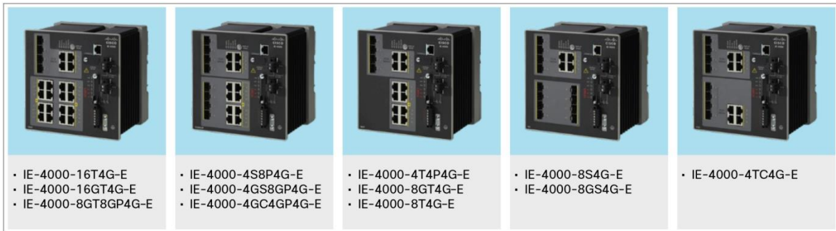
Figure 1. IE 4000 Models

Figure 1 shows switch models, Table 2 shows all the available Cisco IE 4000 Series models, Table 3 list the SW license PIDs and Table 4 lists the power supplies for Cisco IE 4000 Series Switches.