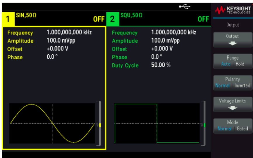
Figure 2. Dual-screen display of standard sine and square wave