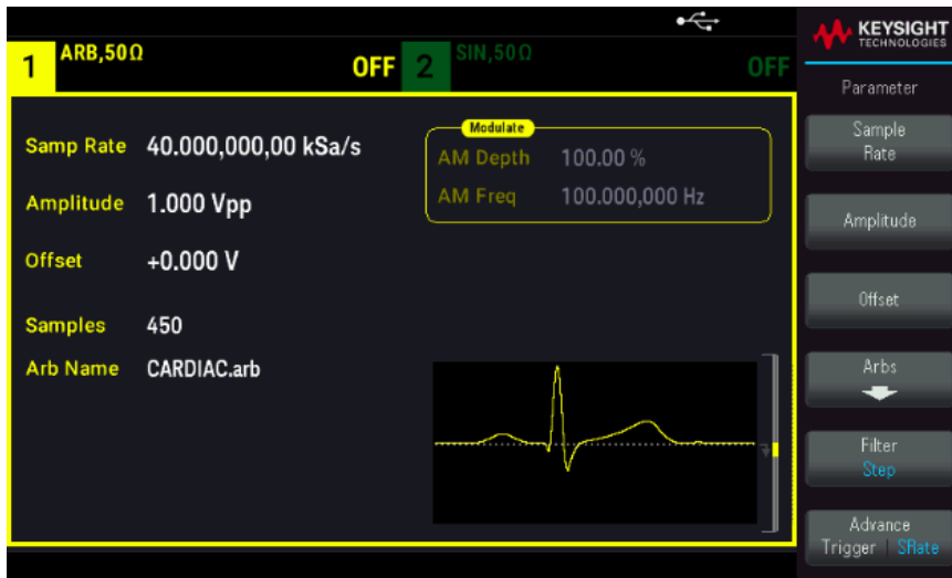
Figure 4. Cardiac specialty waveform