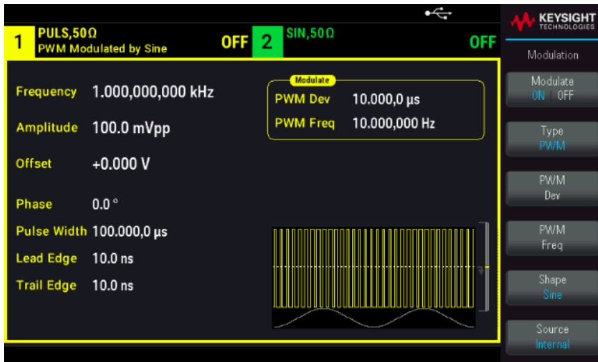
Figure 3. PWM modulated with standard sine wave