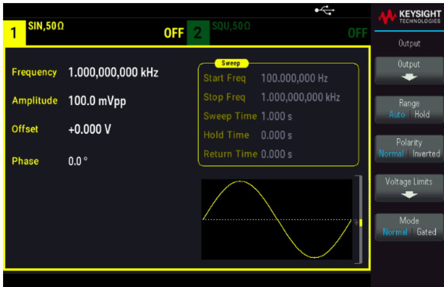
Figure 1. Standard sine wave and setting