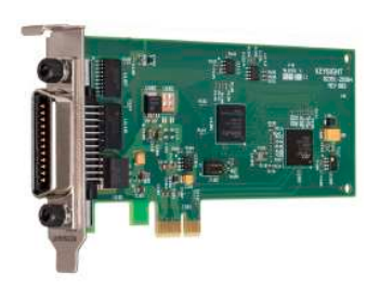
82351B with low-profile bracket