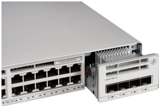
Figure 3. Cisco Catalyst 9200 Series Switch dual redundant power supplies

Table 3 lists the PoE+ power availability for each model.