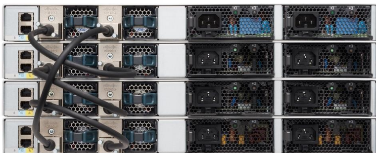
Figure 4. Cisco Catalyst 9200 Series Switch stacked units