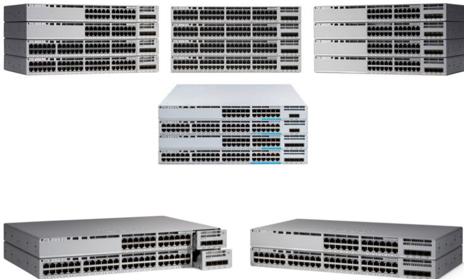
Figure 1. Cisco Catalyst 9200 Series switches

The Cisco Catalyst 9200 Series is made up of modular (C9200) and fixed (C9200L) switch models.