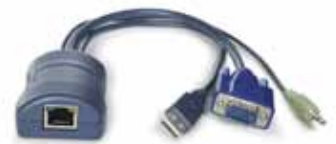
Example CAM: CATX-USB-A

Sun CAM: CATX-SUNA (Sun plus audio) Serial flash upgrade cable (4-way jack connector to 9-way D-type male serial connector): CAB-9DF-RJ9-2M