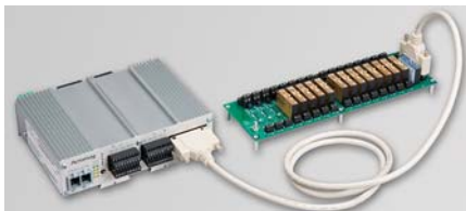
Interface to 8B signal conditioning modules.

EtherStax units are built and tested for high reliability and dependable performance in hostile environments. Available in an aluminum enclosure or as an open circuit board, both formats stack vertically to maintain a very small footprint.