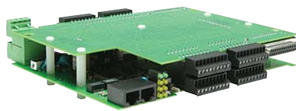
Open circuit board versions are also available.

CE, UL/cUL (pending): Zone 2, Class 1, Division 2, Groups ABCD