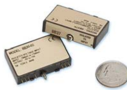
Select from more than 100 8B input modules.