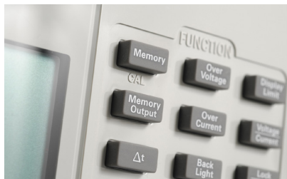
Figure 1. Output sequencing made easy with intuitive keypads

Both models of the U8030 series come with a set of features to suit your needs while remaining easy to use. The LCD screen displays both voltage and current readings in a one-view panel while the all ON/OFF button allows multiple outputs to be controlled simultaneously. Additionally, the auto-track feature simplifies setup between output 1 and output 2. With these, you get a solid bench power supply plus a set of convenient and easy to use features.