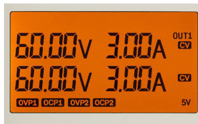
Figure 2. Backlight on/off feature with dual reading (voltage and current) on an LCD display