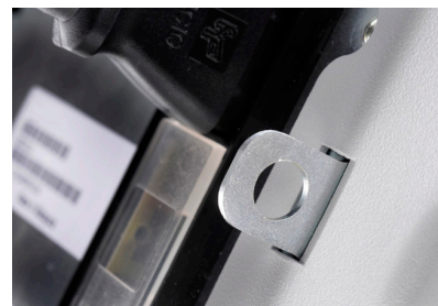
Physical lock mechanism as illustrated

Essential security features: Over-voltage protection (OVP)/ Over-current protection (OCP), keypad lock and physical lock mechanism