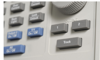
Figure 3. Simplifies Output 1 and Output 2 setup with tracking feature