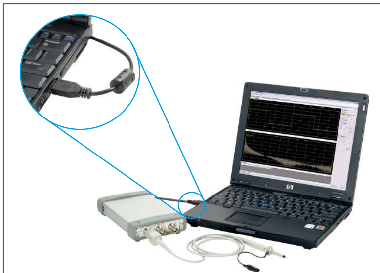
Figure 2. The U2701A and U2702A connect to the computer or laptop with a USB cable, enabling fast data transfer.

The U2701A and U2702A USB modular oscilloscopes offer analysis functions such as addition, subtraction, multiplication, division, and Fast Fourier Transform (FFT). FFT allows you to manipulate the waveform using five types of windows such as Hanning, Hamming, Blackman-Harris, Flattop, and Rectangular.