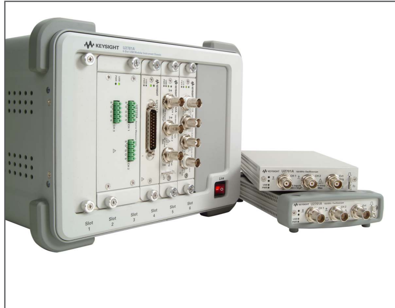
Figure 1. The dual-play capability allows the U2701A/U2702A USB modular oscilloscope to be used as a standalone unit or as part of test system in a cardcage.

The U2701A/U2702A USB modular oscilloscopes are equipped with High-Speed USB 2.0 interface for easy setup and plug-and-play. This ease of use makes the oscilloscopes ideal for the education, design validation and manufacturing industries.