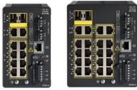
Figure 2. IE-3105 Rugged Series switch models with enhanced feature set