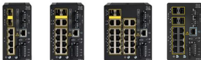
Figure 1. IE-3100 Rugged Series switches models

1 Supported on the IE-3105 variants only.